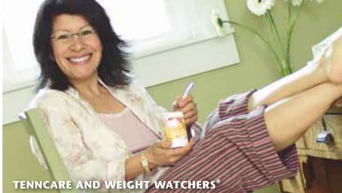
TENNCARE AND WEIGHT WATCHERS ®

Let us know if you are a mother-to-be. Call 1-800-333-3819 . We will send you a free gift and other educational materials. We also have case managers who can help coordinate care for women with high-risk pregnancies.